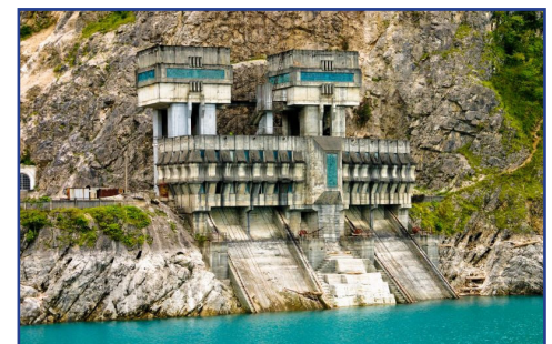
Enguri Dam is located on the Enguri River in Jvari, Georgia.