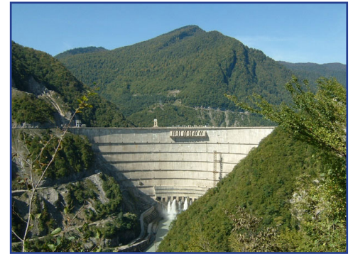
Enguri Dam is one of the highest arch dams in the world.